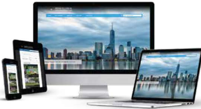
Client RDM Global www.rdmint.com