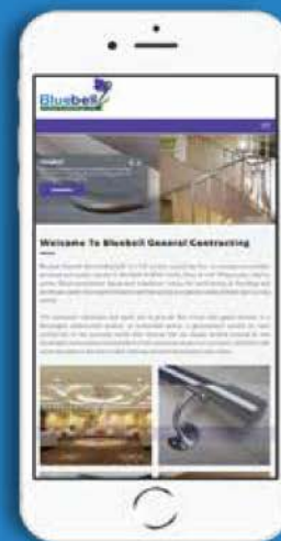
Client Bluebell General Contracting www.bluebellgc.com