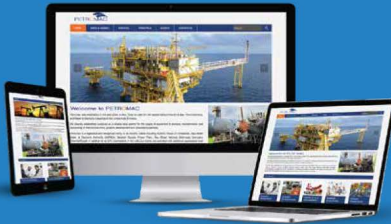
Client Petromac www.petromac.ae