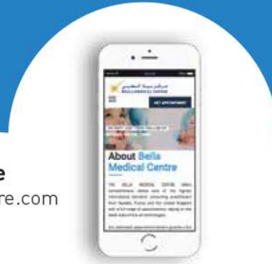
Client Bella Medical Centre www.bellamedicalcentre.com