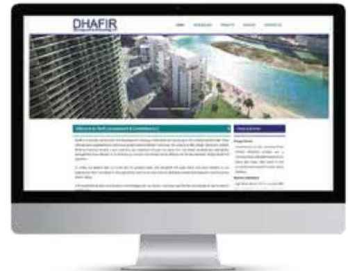
Client Dhafir Development www.dhafirdc.com