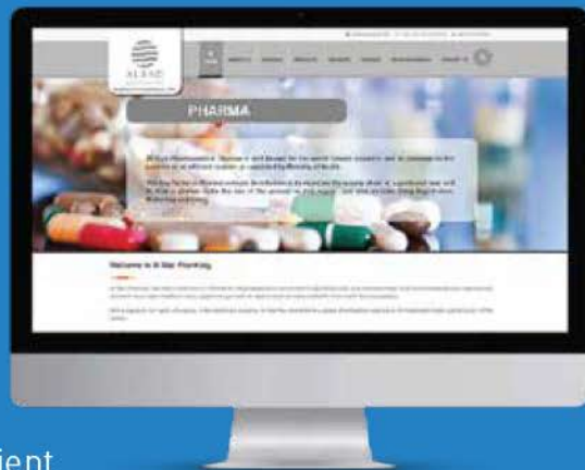
Client Al-Razi Pharmacy Co. www.alrazi.com