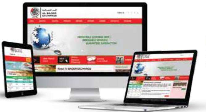
Client Al Bader Exchange www.albaderexchange.com